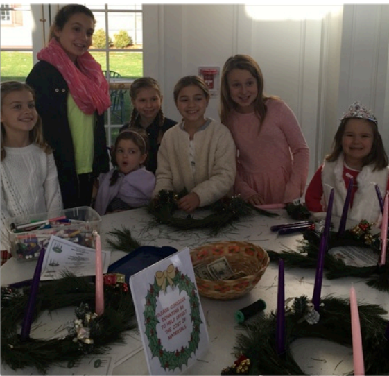
Advent Wreath Making on Sunday November 29th

Sunday, December 13th Pageant costume pick-up 11:15 am in Parish Hall Thursday, December 17th Pageant rehearsal 4-5 pm Speakers Only Saturday, December 19th Pageant rehearsal for All at 10 am Sunday, December 20th Pageant at 10 am (meet in Parish Hall at 9:30 am)