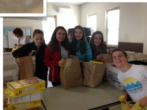
The Confirmation class helping out at the food pantry in Somerville.